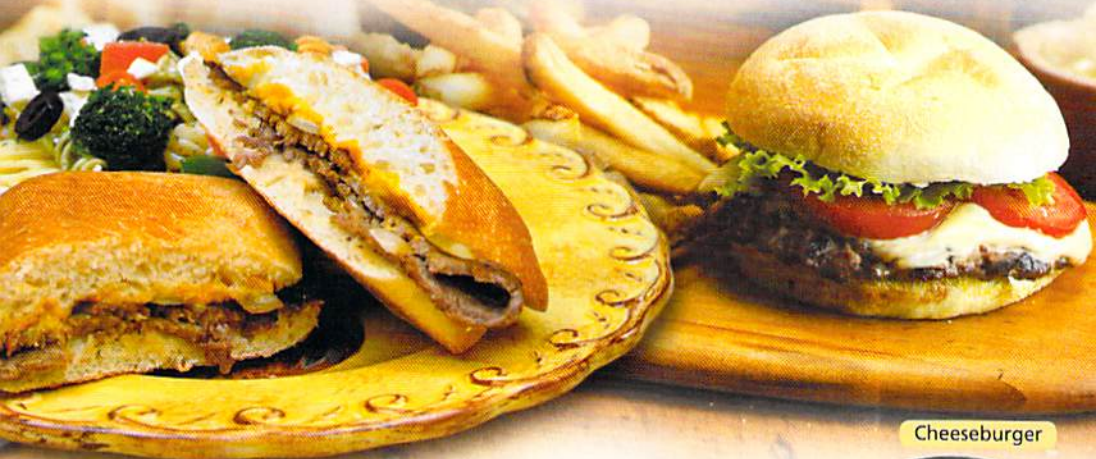
South Philly Steak Panini

Grilled chicken breast with ham, provolone & blue cheese